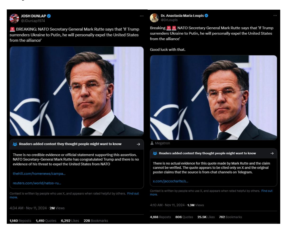
Social media posts about Rutte's claims, some of which had more than one million views

1. On 11 Nov 2024, several social media posts claimed that NATO Secretary General Mark Rutte had said "If Trump surrenders Ukraine to Putin, [I] will personally expel the United States from the alliance". Some of these social media posts on X had more than one million views.