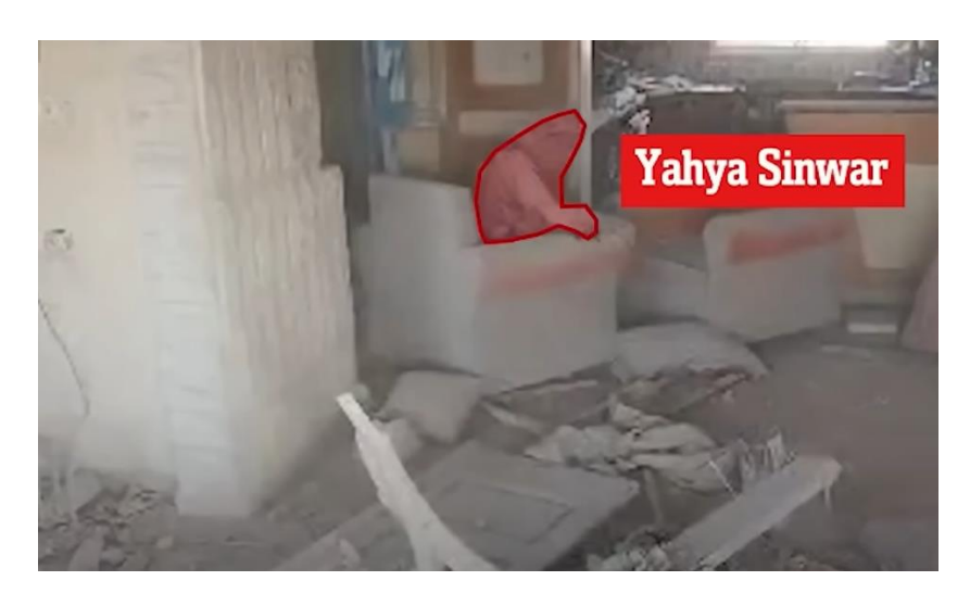
IDF drone footage video showing Sinwar's final moments

4. Following Hamas leader Yahya Sinwar 's death on 16 Oct 2024, the Israeli Defense Forces (IDF) released drone footage of Sinwar's last moments. In the video, a seemingly injured Sinwar was seen sitting alone on a sofa in a destroyed house. Upon noticing the drone, Sinwar defiantly threw a stick at the drone; The Guardian noted that this action set Sinwar apart from his predecessors, who had been assassinated while on the run.